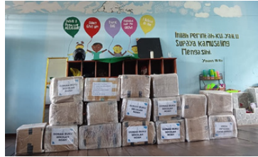
Book Donation from Noah School