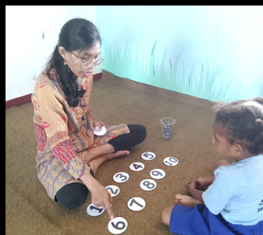
Learn to Count using Rocks