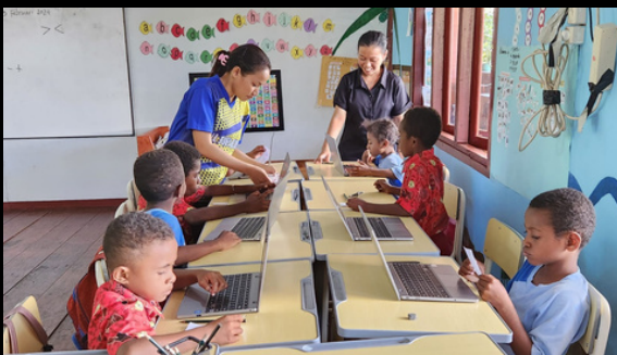
Computer Lessons using Chromebooks