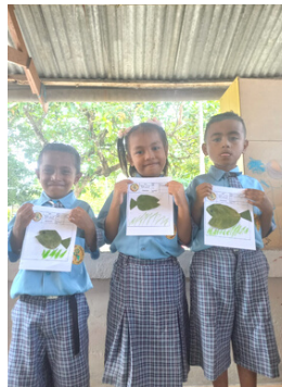
Making Fish Collages from Dried Leaves