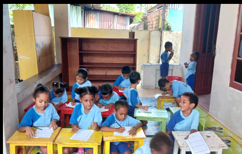
Kami masih mencari 160 sponsor untuk Program Superkids Nutrition