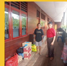
Food Aid from the Church