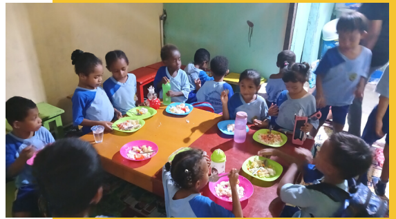
Providing Nutritious Supplementary Food