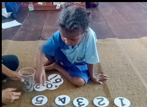
We are still looking for 94 child sponsors for our Adopt A Student Program