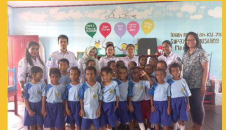
Food Aid, etc. from Local Government (Social Department)