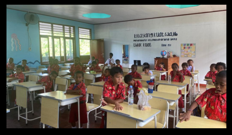
Thank you to every donor who supported the procurement of desks and chromebooks for Kairos 1 Christian Elementary School