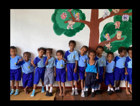
We still need funds of IDR 1,930,715,000 ($129K) for operational needs in July 2023-June 2024