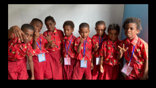
We are still looking for 160 sponsors for the Superkids Nutrition Program