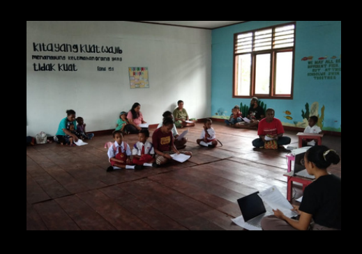
Parent Meeting at the Beginning of the New Academic Year