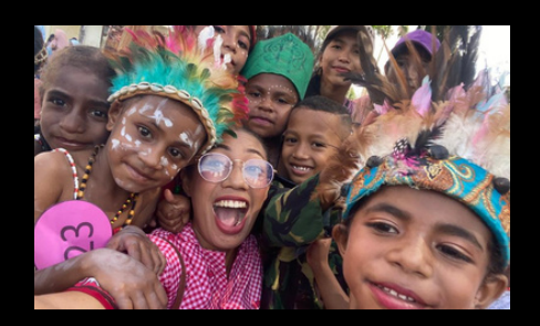
We are still looking for 160 child sponsors for the Adopt A Student Program